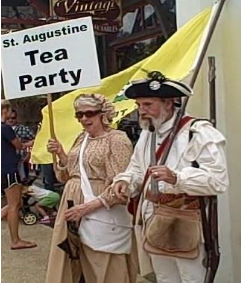
October 2012