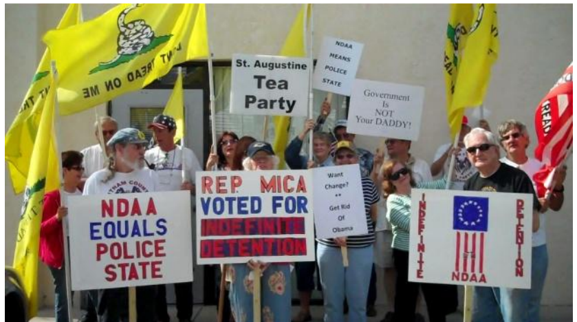
SATP and PCTP Joint Protest 2-3-2012

“Unfortunately and with great sadness the Putnam County Tea Party dissolved last year. When the vote came in, it was not without great heartbreak on my part. I hope you are having better success in St. Augustine. I think it is important for people to hold government accountable.”